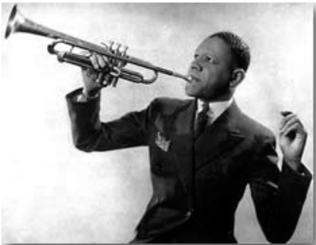
Henry "Red" Allen

Red Allen then reinvented himself forming a sextet of his own which achieved great popularity in New York at clubs like Kelly's Stable and Café Society. This group, with occasional personnel changes, remained together until the early 1950s. His trum-